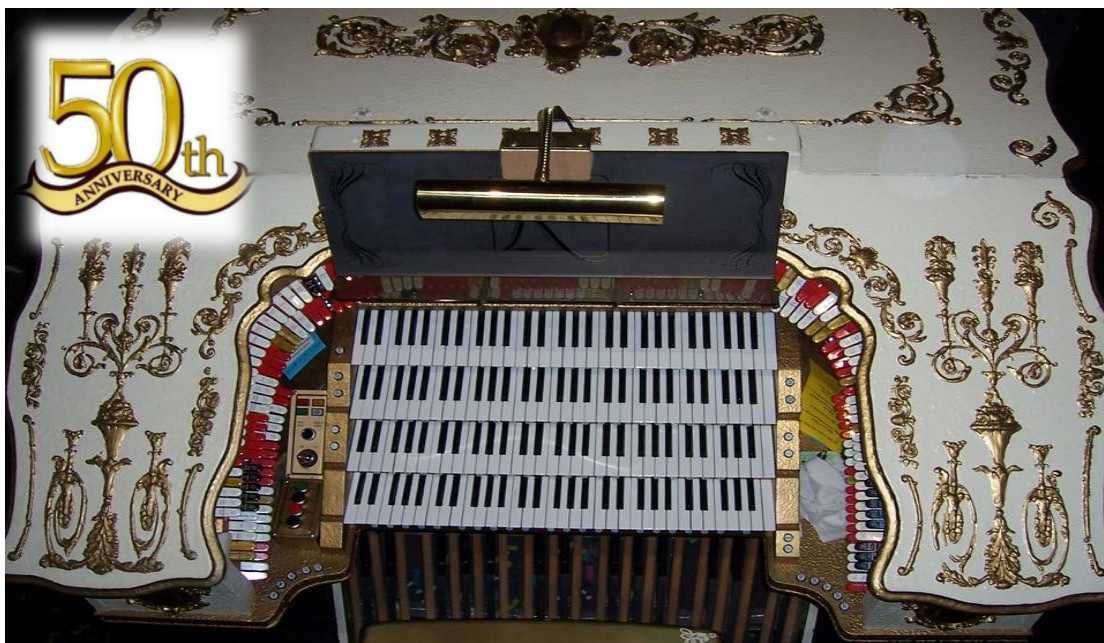
Joliet Area Theater Organ Enthusiasts Celebrating 50 years 1971-2021