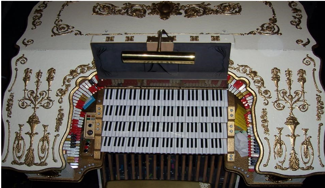
The Rialto's 4/27 Barton Grande Theater Pipe Organ rialtosquare.com/1926-campaign