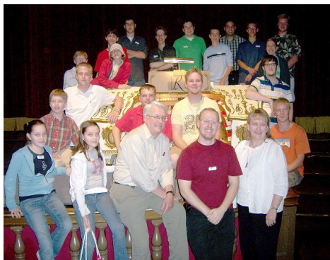
(Left photo) At the Rialto Square Theatre in Joliet. JATOE hosted the kids for an evening, providing a delicious dinner in the rotunda of the theatre, then letting the kids play the organ...some coming up on the lift for the full effect! Donna Parker photo 2007.